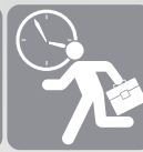
Work Order Tracking