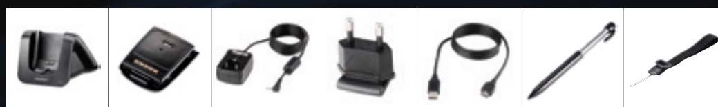
Cradle Battery Adapter Plug Adapter USB Cable Stylus Pen Wrist Strap