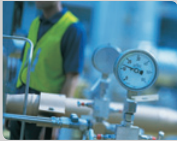
Field Force Automation