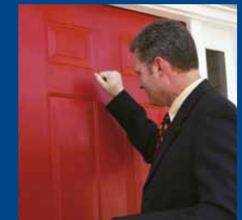
<Door to Door Sales>

M3 SMART, which is Ultra light and slim but rugged PDA, suites perfectly for daily works where the handheld device is being carried and events occur all the time such as mailing, delivery, ticketing, etc. In logistics and government branches area, accurate data process with fast speed will give you trust and reliable on using M3 SMART.