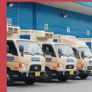
<Food & Beverage>