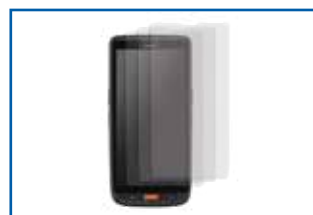
Screen protection sheets, 10pcs HA-T90PS10

Android, Google Maps, Google Mail, Google Play, Google Drive, Hangout and Chrome are registered trademarks of the Google, Inc., USA. MIFARE is a registered trademarks of the NXP B.V. The Bluetooth® trademark is owned by Bluetooth SIG, Inc., U.S.A. and licensed to CASIO Computer Co., Ltd.. Other Product- and company names are either trademarks or registered trademarks of the respective owners. The design and specifications may be varied without notice. The color display of pictures may vary from the actual colors. Screen images are simulated representations. The specifications in the table above are as of October 2019.