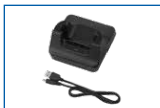
Cradle, only charging function (incl. AC Adapter) HA-T30CHG