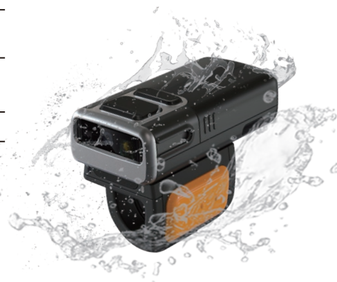
IP65 WATER/DUST RESISTANCE